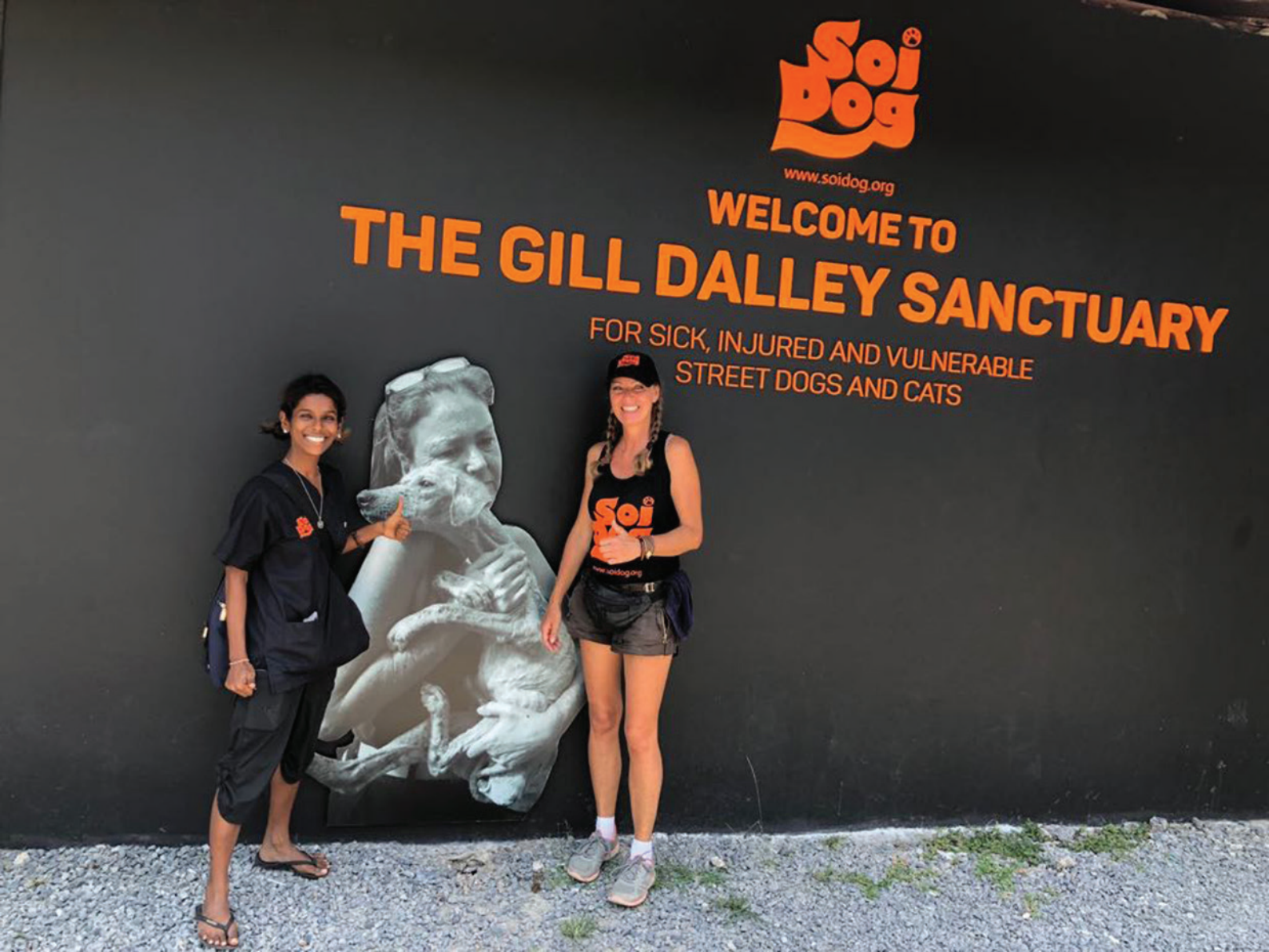
SoiDog – or how to make dogs and people happy