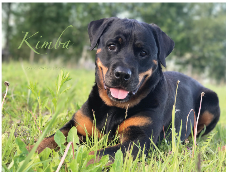
Kimba, 25.02.2010 - 27.01.2018

We went to the vet with our beloved Kimba. The diagnosis of cancer and a malignant blood cancer pulled the ground out from under our feet. She was far too young and now we only had a few months left with her. On January 27, 2018, we had to let her go forever. It broke our hearts and even today it hurts to think that she is no longer here. Anyone who has ever lost a beloved animal knows how many tears are shed and the enormity of the grief. How do you continue when daily routines and the close companionship of 8 years have to be rearranged?